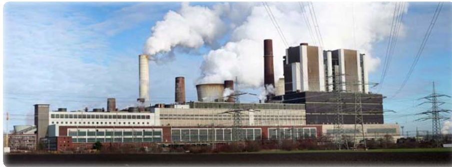
Figure 2. At power generation plants, the need for reduced energy costs, lower environmental load and minimized use of raw materials has never been greater.

At power generation plants, for example, the need for reduced energy costs, lower environmental load and minimized use of raw materials has never been greater. Every power producer is looking for ways to boost performance. This demand is spurring new applications for software products, intelligent control systems, low-consumption components and services. Process automation can make a major contribution to improving energy efficiency (See Fig. 2).