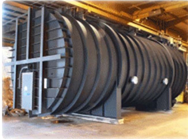
Figure 3. Aside from the process-critical equipment assets found at a typical industrial site, there are often numerous “supporting” assets that make up the balance of the plant.

Aside from the process-critical equipment assets found at a typical industrial site, there are often numerous “supporting” assets that make up the balance of the plant. These components may include thermal systems and equipment directly involved in converting energy in the steam into electrical power, the process service systems and equipment required to achieve proper performance of the conversion system, and the electrical power systems and equipment that supply the electrical energy to the various plant auxiliaries and also transport the electrical power to the grid (See Fig. 3).