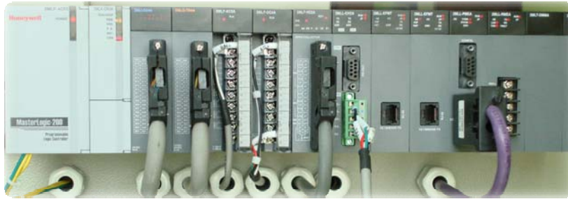
Figure 4. Honeywell's MasterLogic line of high-speed, compact programmable logic controllers (PLCs) meets the needs of customers with a wide range of industrial infrastructure projects.

In 2009, Honeywell introduced its next-generation MasterLogic line of high-speed, compact programmable logic controllers (PLCs) to meet the needs of customers with a wide range of industrial infrastructure projects. MasterLogic offers all of the redundancy architecture options needed for most BoP operations — and at a lower cost than other global brands. Its advanced technology brings higher speed processing and better control (See Fig. 4).