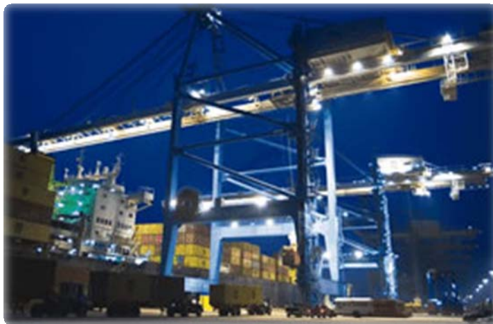
Figure. 1 Around the global, vast social infrastructure projects are yielding highways, tunnels, power plants, cement plants, mining operations, schools, hospitals and water treatment facilities.

All around the globe, entire eco-systems of economic activity have emerged. From China and India to Russia and Brazil, exciting growth is taking place. Vast social infrastructure projects are yielding highways, tunnels, power plants, cement plants, mining operations, schools, hospitals and water treatment facilities (See Fig. 1).