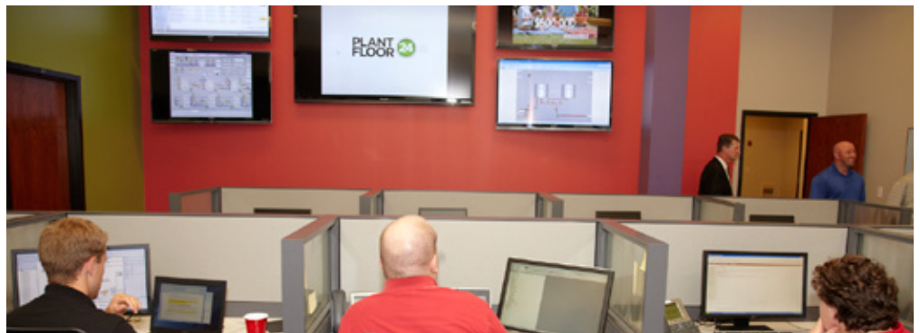
Some system integrators offer off-site monitoring and support on a 24/7/365 basis, and can thus provide ongoing assistance for automation integration projects.

Some systems integrators also offer off-site 24/7/365 multi-platform support, which can be valuable when dealing with integration issues. Automation vendors continually upgrade their offerings, sometimes to add features, and other times to fix bugs and other problems. Upgrading one application often leads to problems in integration among applications, with immediate attention required from personnel familiar with the nuances of all of the applications. Off-site monitoring and support can be an ideal way to address these types of issues, and is often more cost effective than adding permanent in-house staff to handle what are typically intermittent problems.